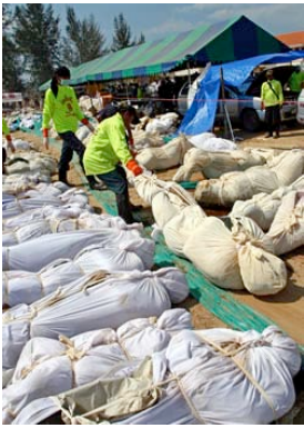
Khao Lak, North of Phuket Volunteers sorting bodies preparatory to DNA sampling and storage