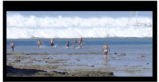
A news shot of the wave bearing down

...Tony Abbott, and offering our sympathy, support and the expertise of members. Since that time IAPA office bearers have been working with a number of local and international organizations including the WPA, IPS and local professional bodies within the affected countries. It has also been able to work with a number of eminent members of the local and overseas psychiatric community with expertise in mass disaster management.