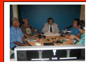
Pacific islands radio